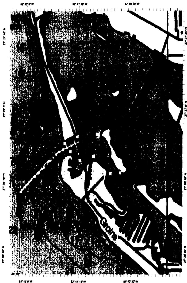
Chart Name: LEMON BAY TO PASSAGE KEY INLET Chart ID: 11424, 1 Top Left: 27° 28' 0" N 82° 42' 14" W Bottom Right: 27° 25' 17" N 82° 38' 48" W