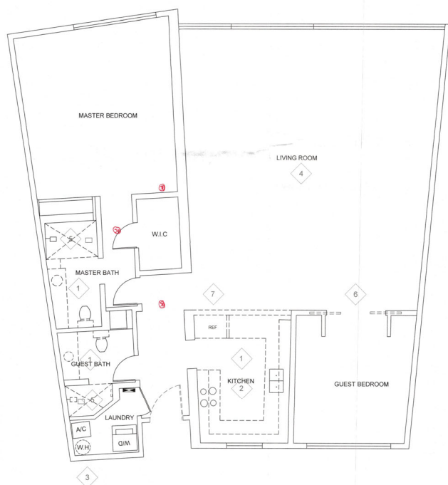
1/4'' = 1'0''

FLORIDA BUILDING CODE 2020 7TH ED FLORIDA BUILDING CODE 2020 7TH ED PLUMBING FLORIDA BUILDING CODE 2020 7TH ED ELECTRICAL NEC 2017