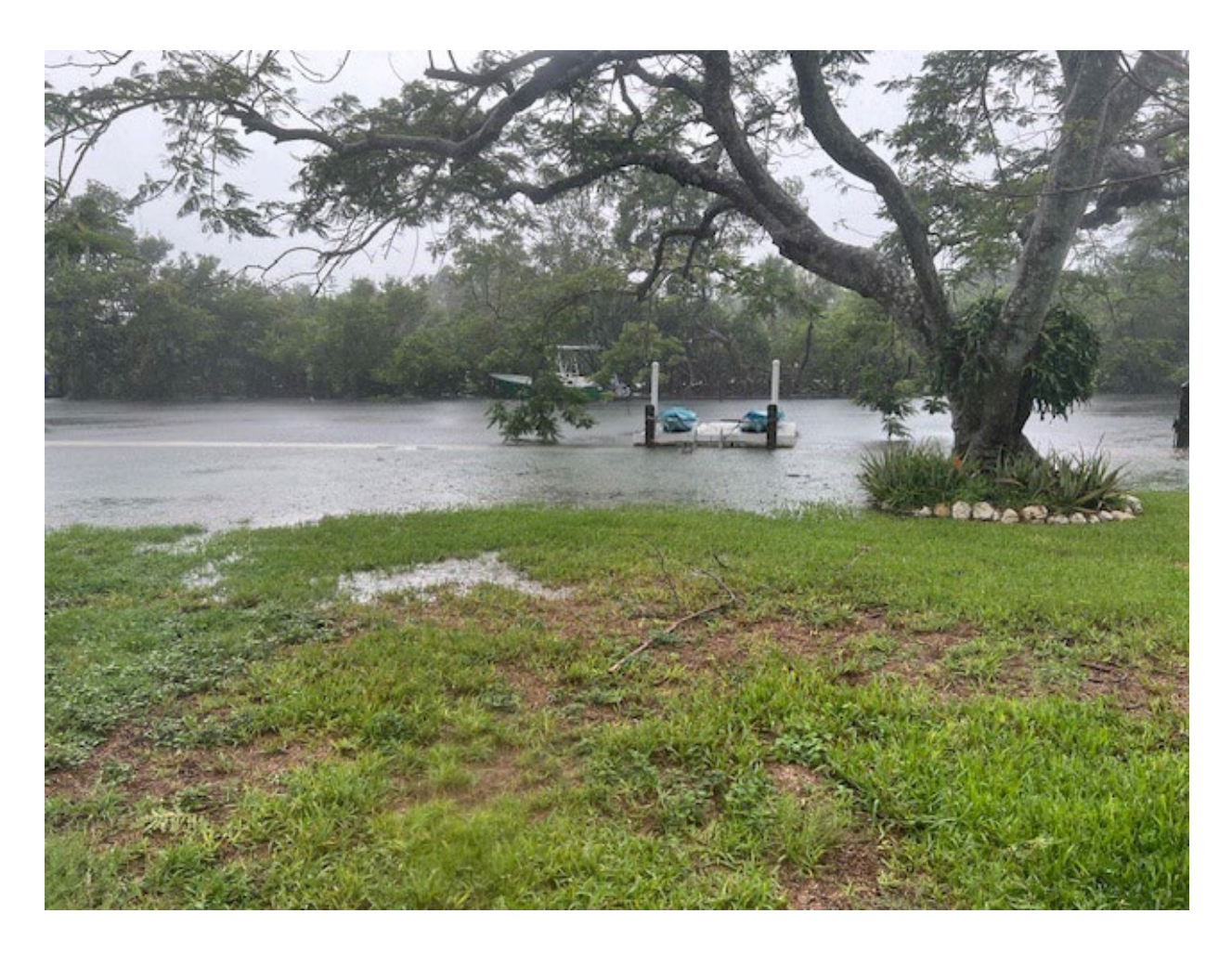
Sent from my iPhone