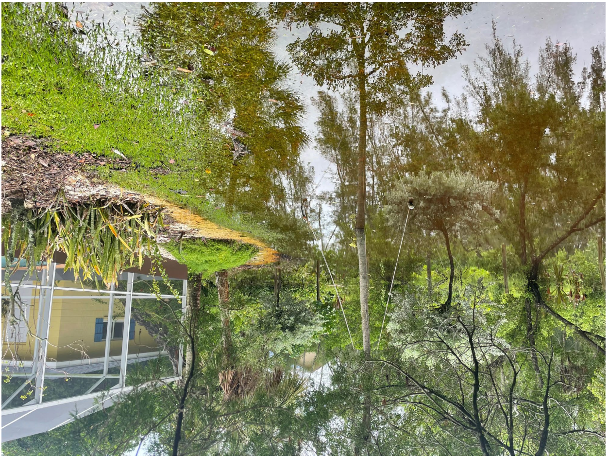
Back of house