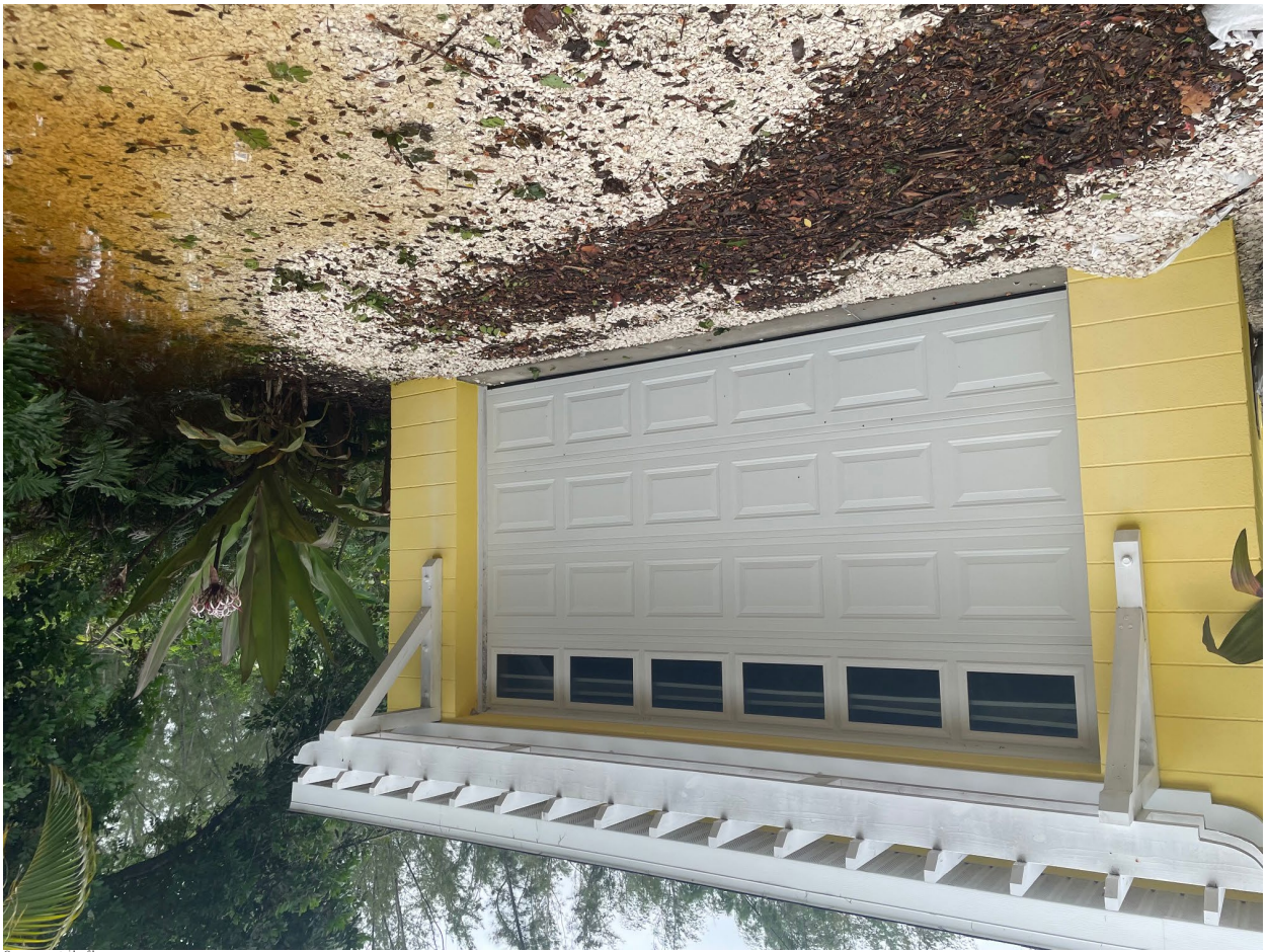
Garage on west side of house. Sent from my iPhone