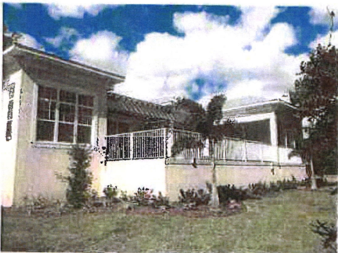
REAR VIEW 11/30/2015