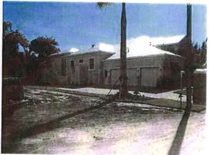
LEFT SIDE VIEW 11/30/2015