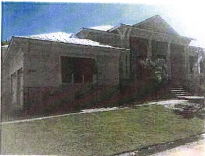
FRONT VIEW 11/30/2015

If using the Elevation Certificate to obtain NFIP flood insurance, affix at least 2 building photographs below according to the instructions for Item A6. Identify all photographs with date taken; "Front View" and "Rear View"; and, if required, "Right Side View" and "Left Side View." When applicable, photographs must show the foundation with representative examples of the flood openings or vents, as indicated in Section A8. If submitting more photographs than will fit on this page, use the Continuation Page.