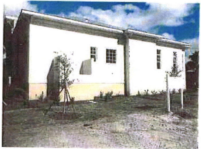
RIGHT SIDE VIEW 11/30/2015