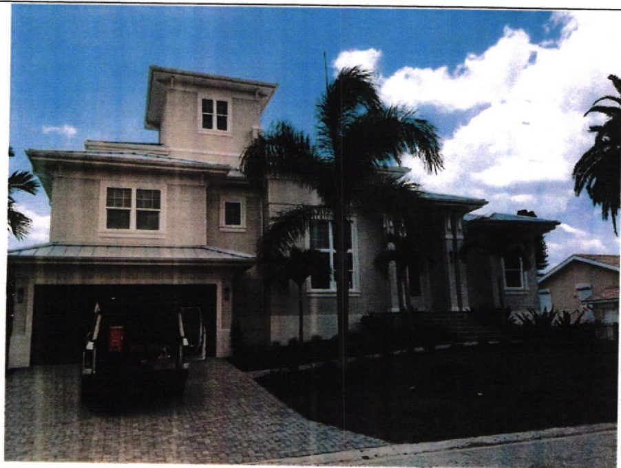
FRONT VIEW 05/16/17

If using the Elevation Certificate to obtain NFIP flood insurance, affix at least 2 building photographs below according to the instructions for Item A6. Identify all photographs with date taken; "Front View" and "Rear View"; and, if required, "Right Side View" and "Left Side View." When applicable, photographs must show the foundation with representative examples of the flood openings or vents, as indicated in Section A8. If submitting more photographs than will fit on this page, use the Continuation Page.