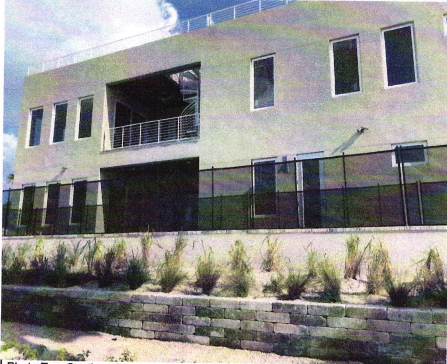
Photo Two Caption Rear view with pool deck and planter box