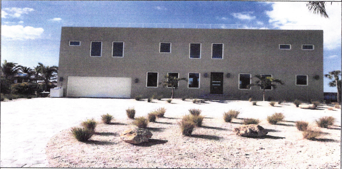
Photo One Caption Front View

If using the Elevation Certificate to obtain NFIP flood insurance, affix at least 2 building photographs below according to the instructions for Item A6. Identify all photographs with date taken; "Front View" and "Rear View"; and, if required, "Right Side View" and "Left Side View." When applicable, photographs must show the foundation with representative examples of the flood openings or vents, as indicated in Section A8. If submitting more photographs than will fit on this page, use the Continuation Page.