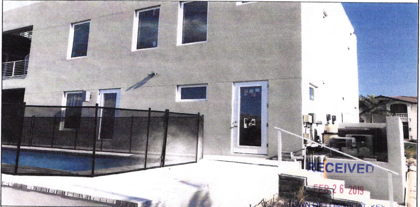
Photo Two Caption Rear view