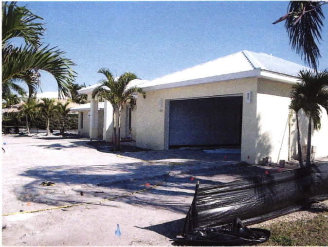
FRONT VIEW 1/7/15