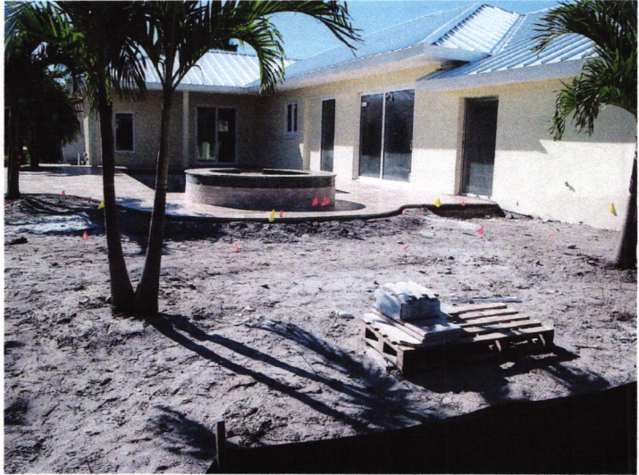
REAR VIEW 1/7/15