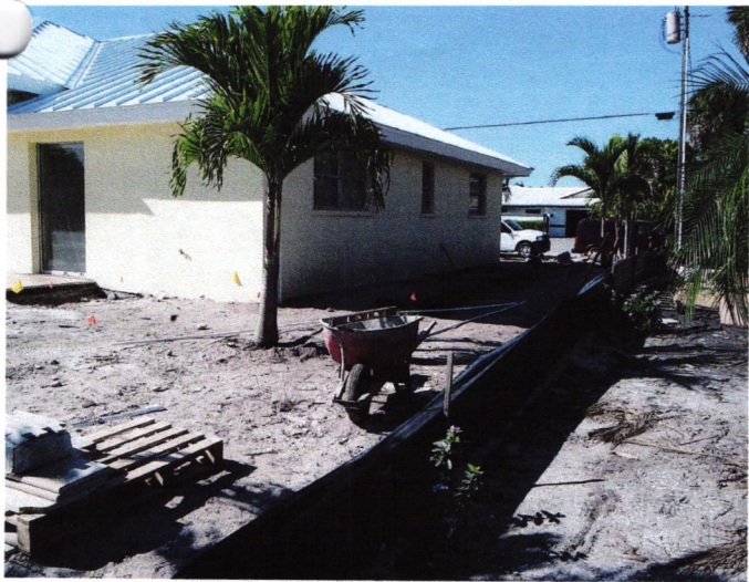
LEFT SIDE VIEW 1/7/15